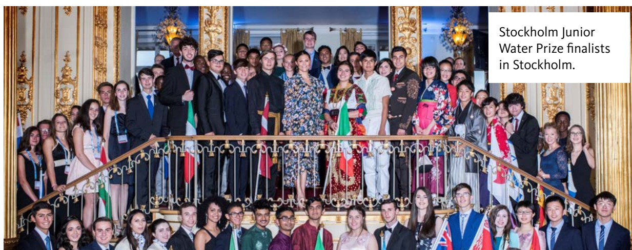
Stockholm Junior Water Prize finalists in Stockholm.