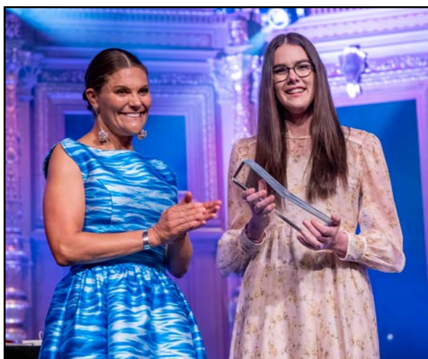
H.R.H. Crown Princess Victoria of Sweden is the patron of the Stockholm Junior Water Prize.

This handbook contains information on your responsibilities as a national organizer and how to best carry out your assignment.